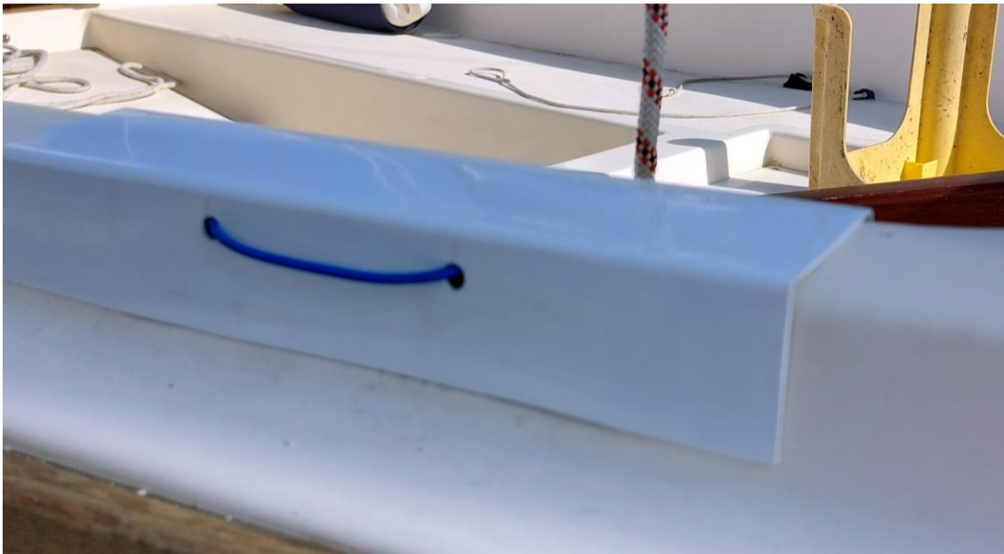
Cover Fitted - Outboard Side