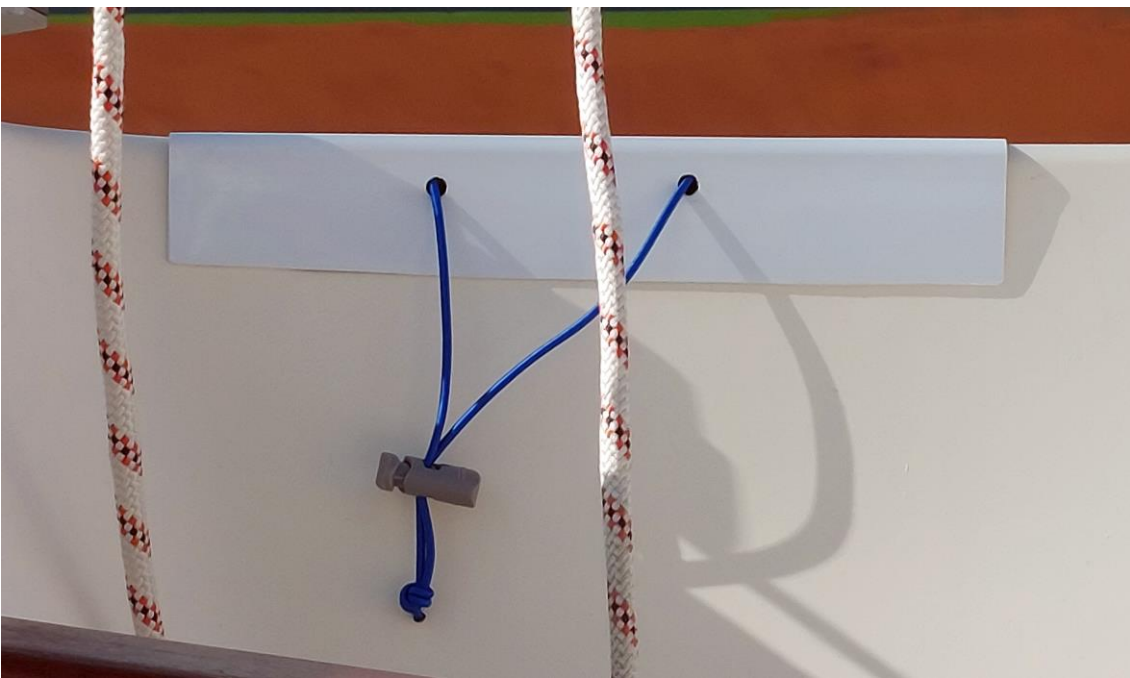
Cover Fitted – Inside Cockpit