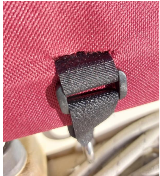
Bottom Batten Attachment to Safety Line Eye