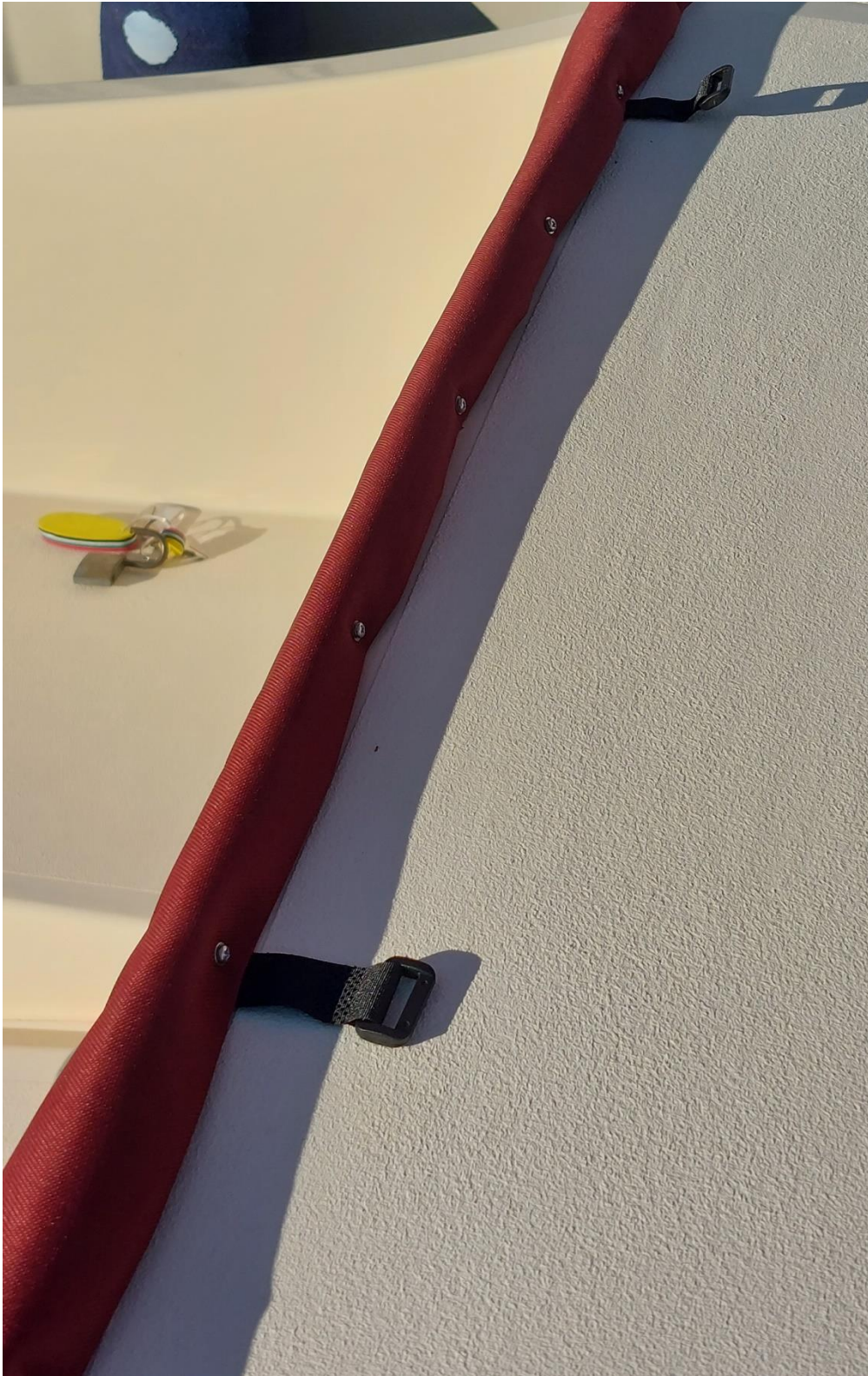
Cover Rolled On Hatch Showing Velcro Straps