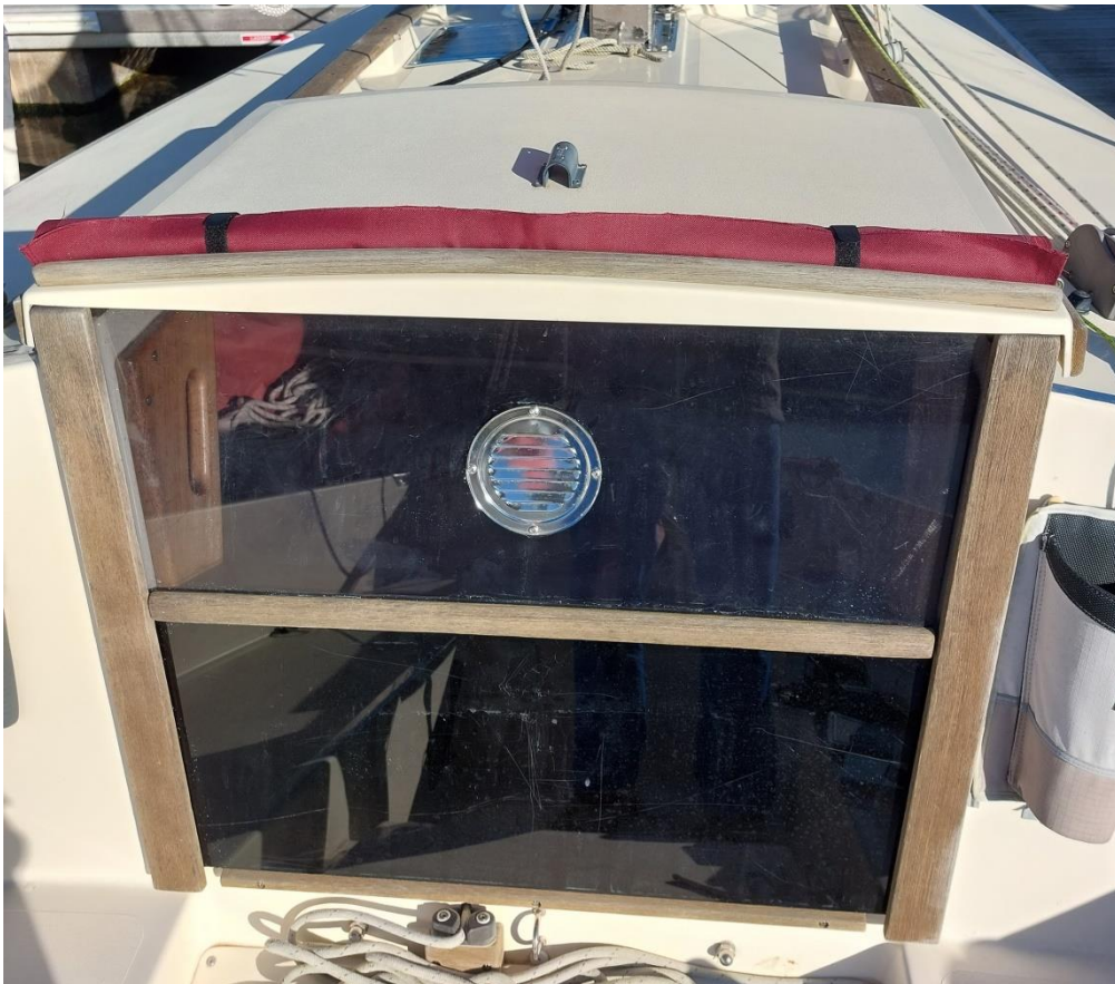
Rolled & Stowed on Hatch