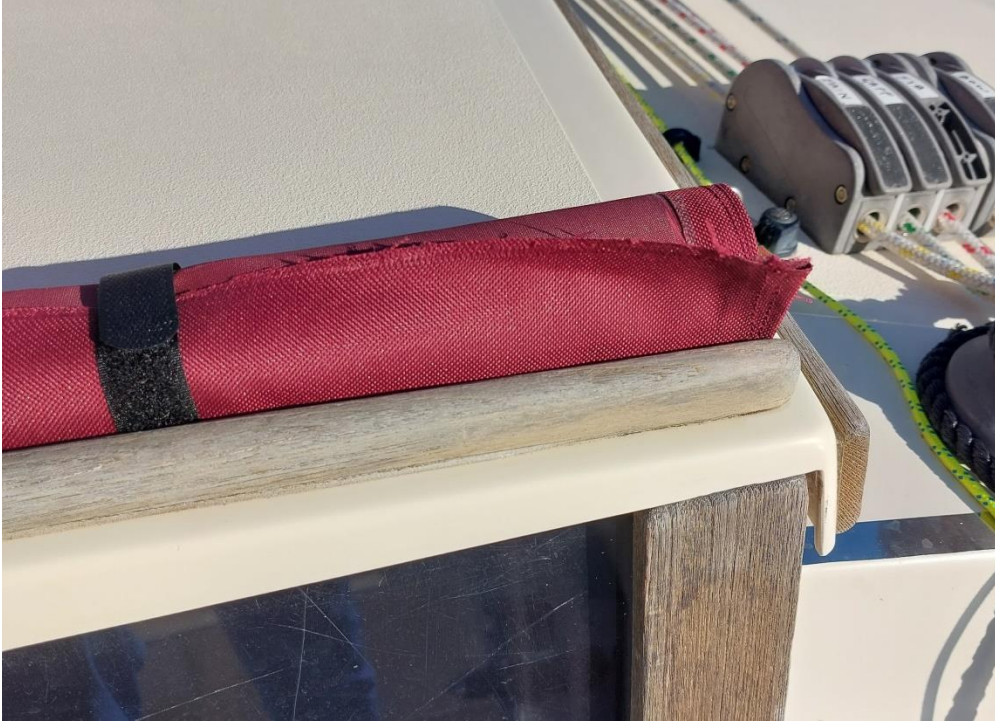
End Detail of Rolled Cover