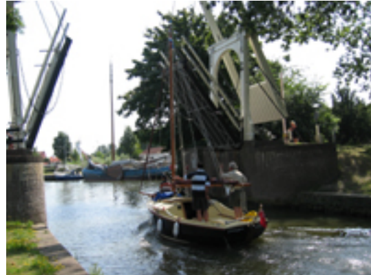
Cruising through the Dutch Canals

"Terribly sorry, but your yacht is not big enough" came the reply from the Royal Naval Sailing Association office in response to my request for a blue ensign permit. Perhaps I should have taken this as a hint and abandoned what many would consider a crazy project to sail our Shrimper "Freya" from Plymouth to Norway during the summer of 2003, and then sail the entire length of Norway the following year.