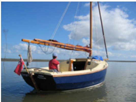
Waiting for the tide in the Waddenzee

Having traversed the canal, the intention was to work our way through the Danish Baltic islands to Copenhagen before crossing the Sound to Sweden and continuing up the west Swedish coast to Gothenburg and finally on to Oslo. The leg from Halsingborg to Gothenburg contained some relatively barren and exposed stretches, but once north of Gothenburg we would enjoy the shelter of the sjogard , a chain of thousands of small islands lining the coast up to Oslo Fjord.