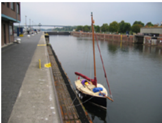
Small boat – big lock- Kiel Canal!

Our objective for this summer was to get the boat as far as Oslo. Although a seemingly massive journey for such a small boat, I knew that much of it could be completed in relatively sheltered waters. Our planned route would take us up the south coast of England to Dover, before crossing to Calais and continuing along the French and Belgian coasts to Vlissingen in southern Holland. This would potentially be the most exposed leg of the cruise.