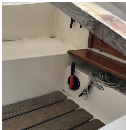
Fig 4 – New pump installed seen from the cockpit