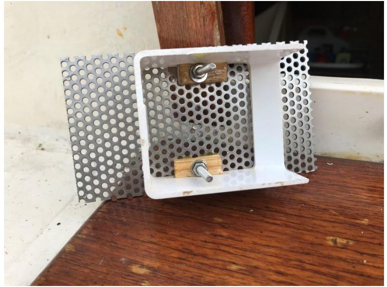
Figs 5 & 6 – Cockpit sump strum box