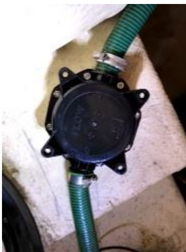
Fig 3 – New pump installed as seen inside cabin