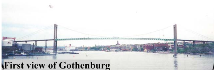
First view of Gothenburg

The ferry took two hours to get to Gothenburg. We had some impressive views of the city as we approached it up through the channel.