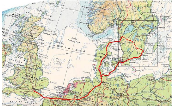
Track of the car journey to Sweden and back

The car and trailer journey to Sweden took three nights with an average speed of about 40 mph. We passed through five countries including France, Belgium, Holland, Germany and Denmark. On dual carriageways we drove at about 55 mph. At night we stopped and used BC as a caravan. This worked very well as instead of using marinas for the loos and washing facilities we used the filling stations. OK, they were more limited than most marinas but it was not a big sacrifice for just a few days. They were also convenient in terms of time as we could buy the necessary stores and fill up with petrol all at the same place. We crossed to Dunkirk on the morning of Thursday, 16 May and drove up through France and Belgium into Holland. Our first night was spent in Hertzogenbosch. We had seen a large cathedral from some distance away and drove slowly through a complicated maze of one way streets which at last led conveniently to a car park just beside it. We found