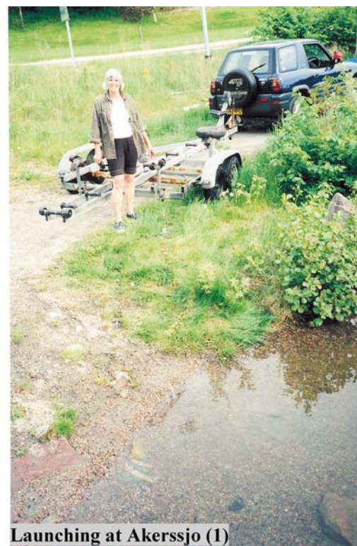
Launching at Akerssjo (1)