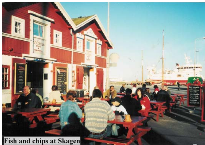
Fish and chips at Skagen

The next morning, Sunday, 19 May, while we sat in the cockpit having our breakfast, a hare with enormous ears lolloped by. It seemed quite oblivious of our presence. From this happy scene we rapidly descended into near despair with our next near disaster.