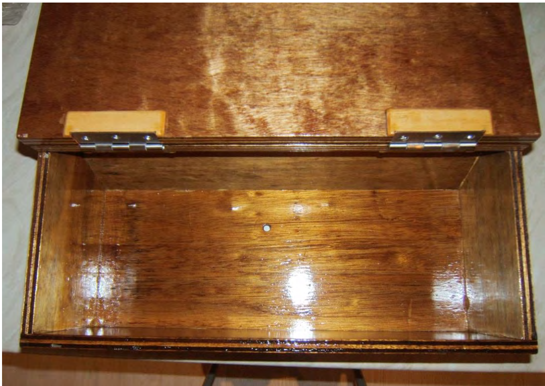
Inside showing wooden extensions at the hinges to allow adequate thickness for the screws