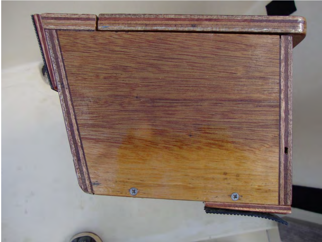
Outboard side showing the fit alignment wedges on top forward and aft bottom corners.