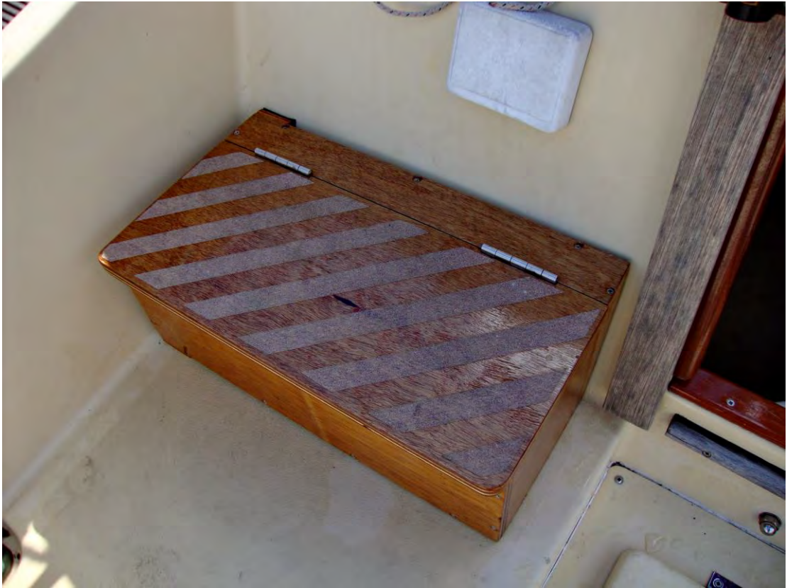
In Position in cockpit