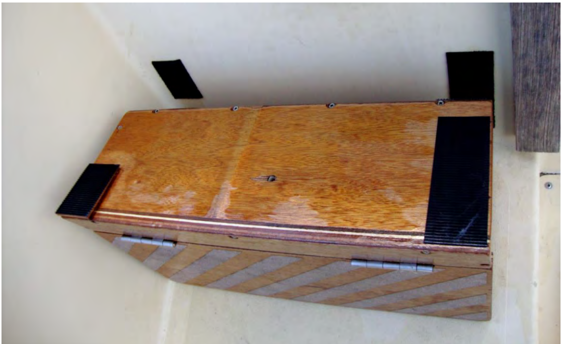
Box tipped aft to show the Velcro attachment