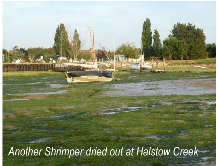
Another Shrimper dried out at Halstow Creek

Monday, 18 th July: Very Hot (42°C - all-time record in the UK) Wind S 2/3. We planned to sail to Conyer Creek where friends lived and we set off at 5.15am (high water) to Queenborough for temporary stay until the Kings Ferry Bridge was due to open. After shopping and sitting in a sheltered spot under trees in a little park, we set off at 11.15am to the bridge (due to open at 11.45am).