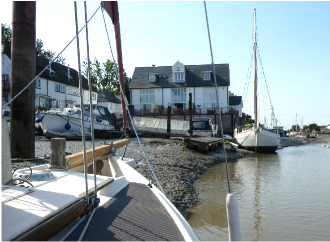
Mooring up in Conyer Creek