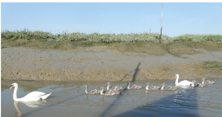
Family of swans in Conyer Creek

We spent the morning trying to keep cool then went for a short walk and found our friends' house. They welcomed us indoors for couple of hours and we admired the field that they had just acquired at the back of the garden. On leaving, we revisited the pub for a lunchtime drink. There was still two hours before the time to leave and it was too hot to sit in the boat, so we found a cool spot in the toilet block with two chairs to sit on – relative bliss!