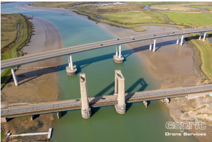
Kings Ferry Bridges

Our VHF calls were only answered as we neared the bridge (three miles from Queenborough). We were informed that the bridge would not open as the temperature was too high. This meant returning to Queenborough to take the mast down. Fortunately, we found a floating pontoon half way back and moored to that to sort out the mast (release the forestay and disconnect the boom).