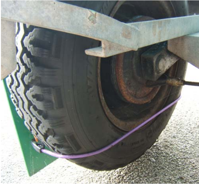
Rear view showing shock-cord attachment