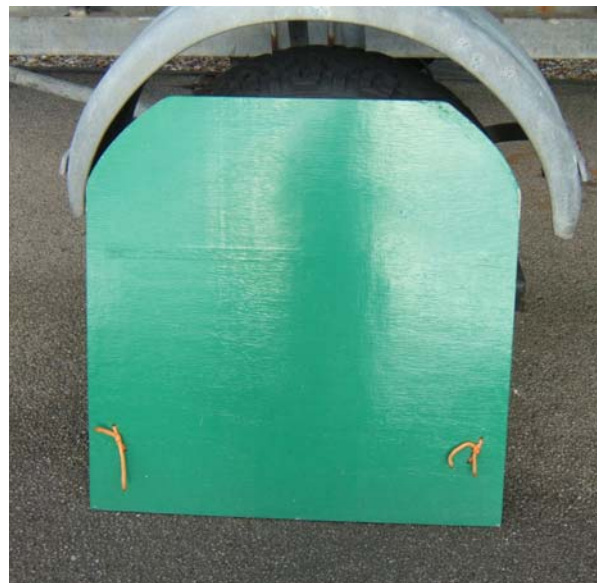
Wheel cover dropped to show top corner profile