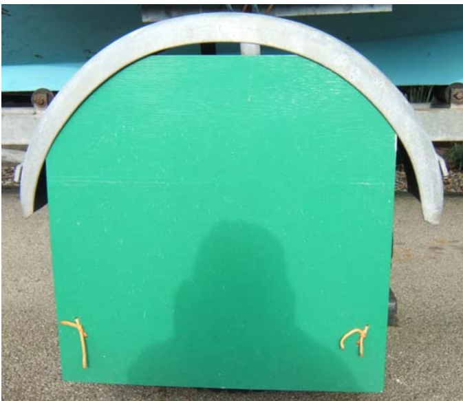
Wheel cover in place