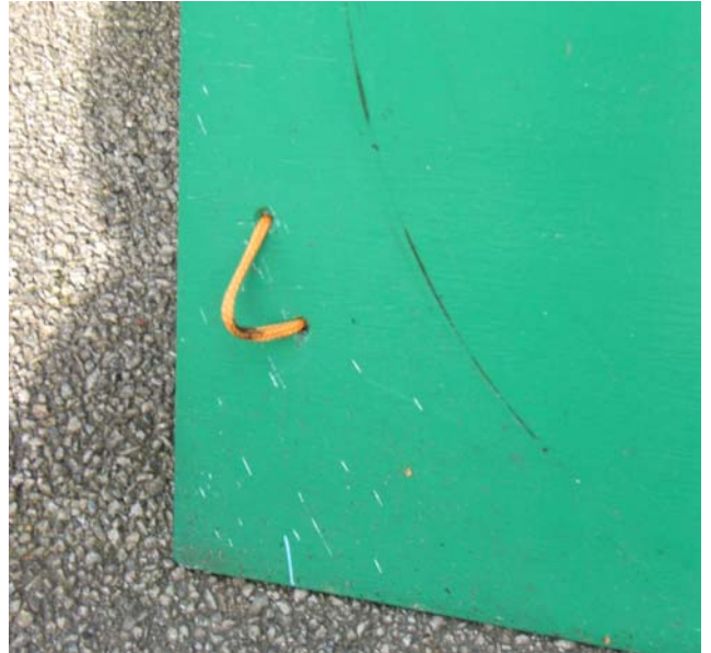
Detail of shock-cord attachment loop