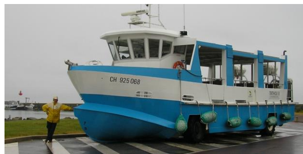
Amphibious Ferry, St Vaast.

At sea it was wet and windy so we took in two reefs and plugged on through the rain squalls against a weak tide. We reached St-Vaast soon after low water but we were able to get into the shelter of the breakwater before taking sails down and motoring in towards the dock gate. It was very shallow but we took