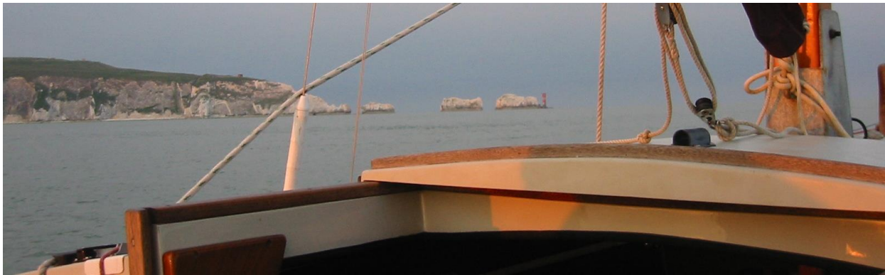
Sunrise at the Needles

A voice was saying "It's time to get up. The time is 4 o'clock." If you have an old Nokia phone you will know the voice! Obedient as ever, Pete and I got up and put the kettle on. Outside it was just getting light on a very still morning so, after a cup of tea, we let go from our overnight berth on the club pontoon and set off down river. A strong tide pushed us through Hurst Narrows to the Needles where, once clear of the swirly whirlies over the Bridge Bank, we picked up a breeze from the east and stopped the outboard.