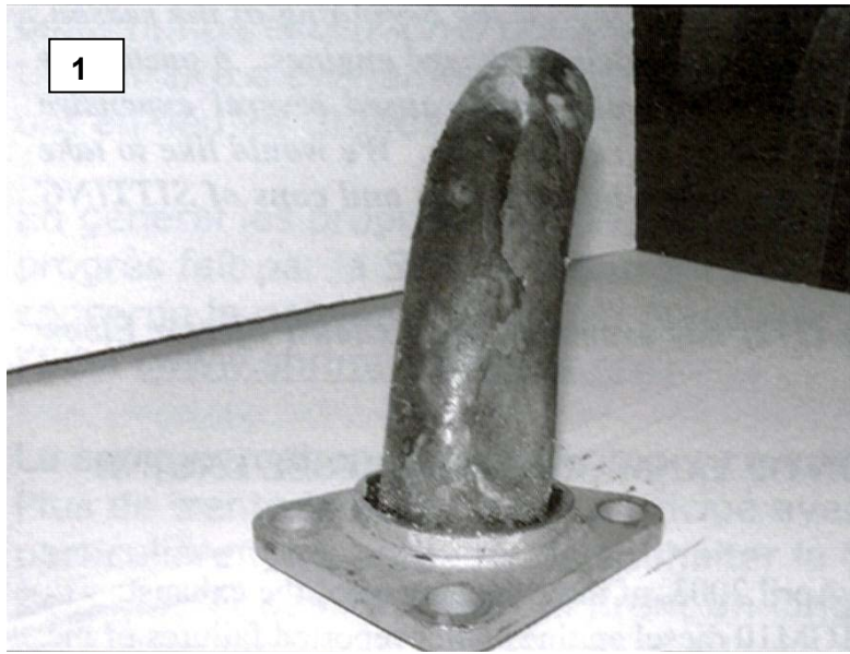
Picture 1 shows the inner tube of the annulus with a distinct "tide mark" of iron oxide and general local corrosion. This tidemark would seem to indicate the level of cooling water that remains in the annulus when the diesel engine is static.

Pictures 2 and 3 are of the same specimen, sectioned and polished. It can be clearly seen that this tube is severely corroded internally and externally to the extent that it has become porous. Any water present in the annulus would be free to pass into the exhaust tube.