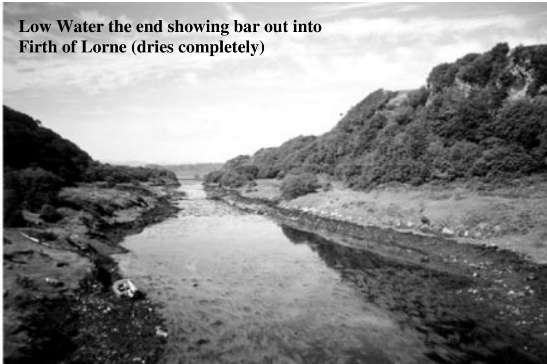
Low Water the end showing bar out into Firth of Lorne (dries completely)

So off we set two days later with a lovely leading wind up Seil Sound and into the Sound of Clachan, where we proceeded with caution as the channel is narrow, with plenty of rocky shoals which have never been properly charted. We rested at a jetty half way up so as to get the last of the tide up to the bridge, where it had already begun to run south at a couple of knots by the time we arrived. This at least gave us the chance to stop and turn back if we chickened out. All was well, however, our mast cleared the arch of the bridge by two feet or so, and with plate and rudder