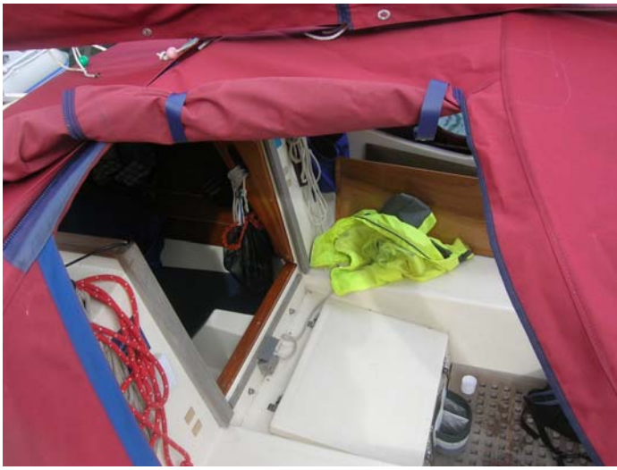
Port side panel rolled up