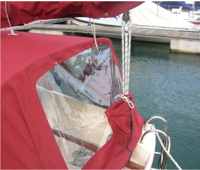
External views of mainsheet sock.

Sock unzips along centre to allow ropes to pass through