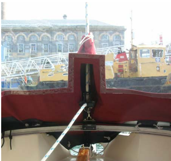
Inside view of mainsheet sock