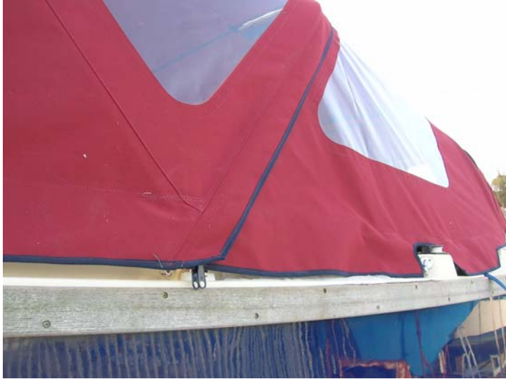
Stdb side looking fwd. Hoop attachment and pivot point is behind the zip pulls.