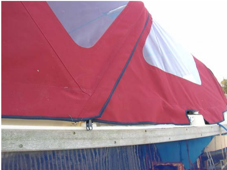
Stdb side looking fwd. Hoop attachment and pivot point is behind the zip pulls.