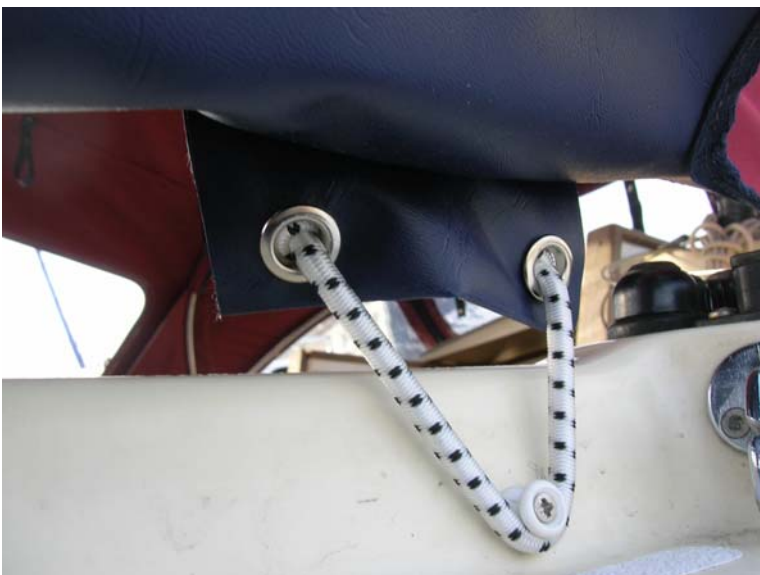
Typical cover attachment bungee & lacing stud on cockpit coaming