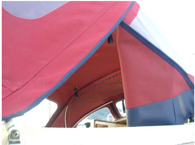
Stdb side centre zip open to show sprayhood attachment & hoop attachment.