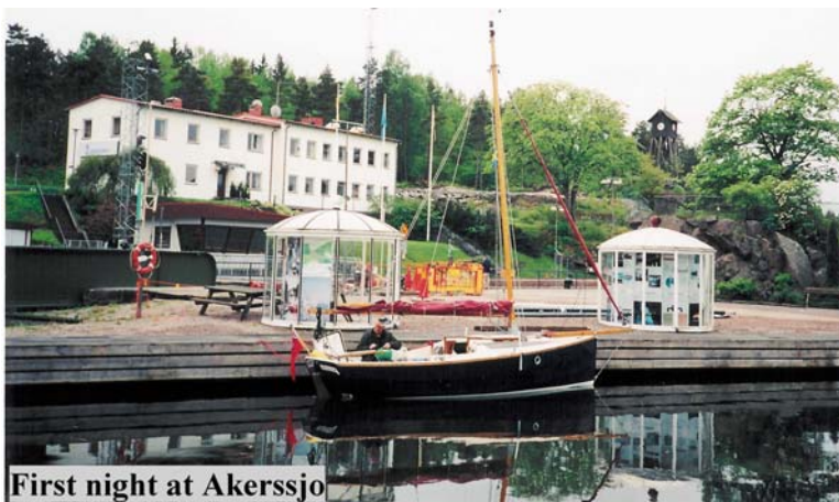
First night at Akerssjo