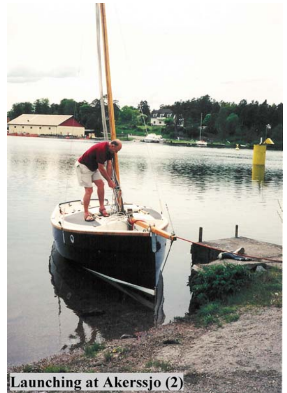
Launching at Akerssjo (2)

Waking up to our first morning afloat we realised that the glorious weather was over. However it wasn't raining and we had achieved the first important step!