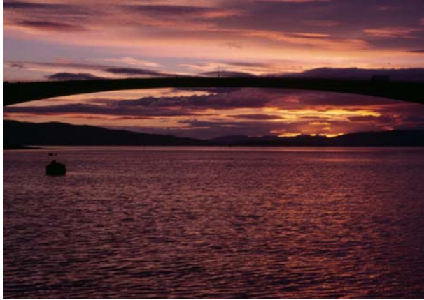
Sunset over the Skye bridge

imminent. The following morning we motored over to Inverie to seek some local