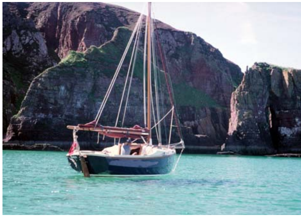
Another idyllic anchorage

like conditions and crystal clear aquamarine sea meant that we were able to pick our way into the bay navigating by means of a lookout stationed on the bowsprit spotting the submerged rocks. Our lifting keel enabled us to creep right up to the beach before anchoring for a lunchtime glass of wine. As we sipped the wine and enjoyed the luxury of our own private “tropical” anchorage it was almost impossible to believe that we were still on the West Coast of Scotland.