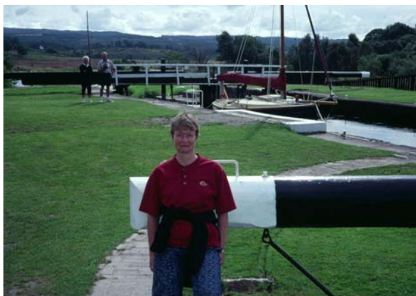
Back Breaking Work

Our passage through the Crinan Canal attracted a lot of attention from various lock keepers and assorted passers by who were clearly surprised to see such a “wee” boat heading out towards the Western Isles. It also brought howls of complaint from the long suffering crew of one, who found the task of operating the lock gates single handedly a back breaking task.