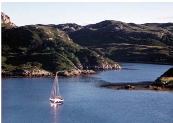
Another crowded West Coast anchorage

Night was falling as we slipped past Mallaig harbour and headed into Loch Nevis. We anchored for the night in Port Guibhais, a spectacular anchorage with swinging room for no more than one yacht, nestling under a steep hill at the southern entrance to the loch. Whilst it was our most spectacular anchorage yet, with its limited swinging room and surrounded on all sides by rocks, it did not seem the ideal place to sit out the gale which the forecasts continued to promise us was