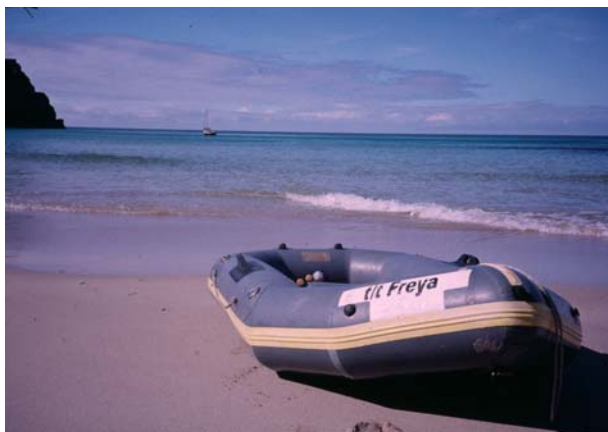
Private tropical Beach

In the days that followed, we took the opportunity of short breaks in the weather to slowly work our way northwards via the Kyle of Lochalsh to the delightful town of Plockton. There we were joined by a 3 rd crew member who had fetched our boat trailer up from Inverkip. By now we were enjoying the benefits of a persistent ridge of high pressure and with 12 days of our cruise remaining, we made the decision to sail northwards as far as Loch Ewe before returning to Kyle of Lochalsh where we would be lifted back onto the trailer.