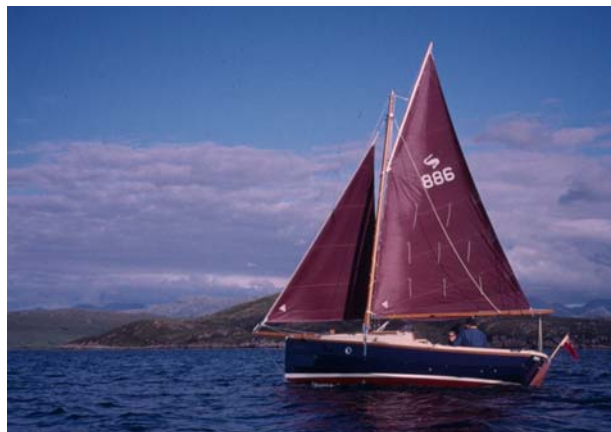
Fine sailing in Loch Shuna

recovering from these exertions in Crinan, we were keen to press on and get through the Dorus Mor tidal race and the potentially exposed Firth of Lorne whilst the weather remained calm; a decision that was vindicated 2 days later when we were forced to spend 2 days stormbound in the sheltered waters of Loch Aline.