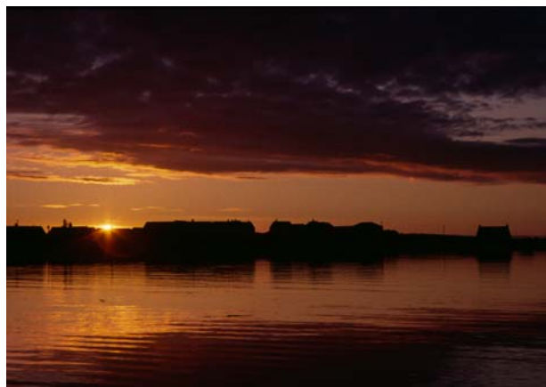
Sunset in Loch Ewe

mentioned in any pilot, and virtually indiscernible on the chart, the mirror