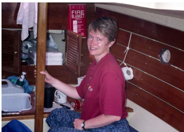
Home for the next 4 weeks – you must be joking!!

Moreover we were determined to prove that cruising in this wildly beautiful area need not be the sole preserve of those in possession of a large heavy displacement yacht. Armed with nothing bigger than our newly acquired 19' Cornish Shrimper and road trailer, we hatched an ambitious plan to cruise almost the entire length of the Scottish West Coast during the summer of 2002. As I described the plan to various sailing friends in the months leading up to the trip, I almost always came away with the impression that they thought I had finally lost my marbles; although of course they were all too polite to say this to my face!