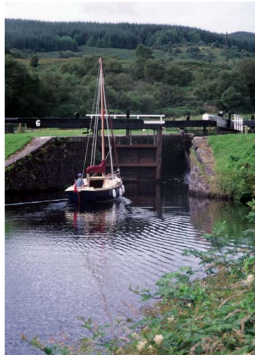
Heading for the Western Isles

The west coast of Scotland is not a place for the faint hearted. Anyone flicking through a yachtsman's pilot for the area is immediately confronted with intimidating descriptions of unmarked rock strewn passages, 8 knot+ tidal races and some of the roughest and most exposed headlands in the British Isles. Add to this a well deserved reputation for truly awful weather and you might be forgiven for thinking that only the most determined of masochists would venture out into its waters for pleasure. However, rich rewards await those who are prepared to take on the challenges of sailing in the area. The splendour of the scenery is a match for anything in the world, and its wild and isolated anchorages are the perfect panacea for those seeking respite from the overcrowded and overpriced marinas of the South Coast of England.