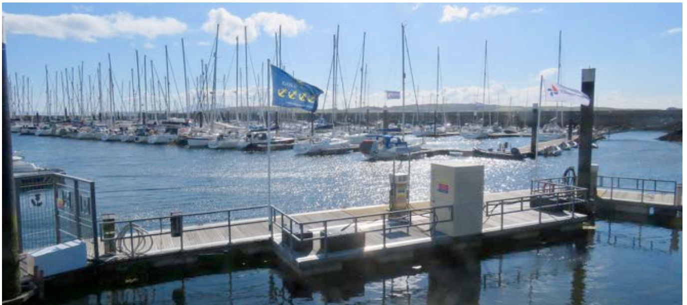
Our starting point at Largs Marina

Our base had to be somewhere we could still ‘have a holiday’ in case gales blew every day, so we chose Largs Yachthaven, which has loads of facilities (chandlers, café, restaurant, workshops, nearby petrol station, just off an A road, no tiny lanes, laundry, showers, washing up facilities, etc.). Although the marina has a slipway, we decided to treat ourselves to a lift in and out as that meant we didn’t need to take the launching box (waders, ropes, launching ramp thing, etc.) and we didn’t need to wait for sufficient launching water.