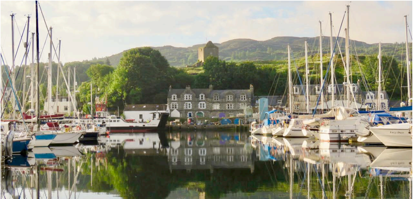
Royal Tarbert Castle overlooking our berth in Tarbert Marina

The following morning we sailed for Tarbert. We knew that by the time we reached the top of Arran there would be a strong northerly, so there were many hours of tacking that day. Another top tip: there are quite a few ferries in the Firth of Clyde area and they move quite fast so it pays to know which way the nearest ferry is heading at all times! Tarbert is a lovely town with all mod cons and has a nice marina with good facilities. We spent 2 nights there, as we liked it so much.