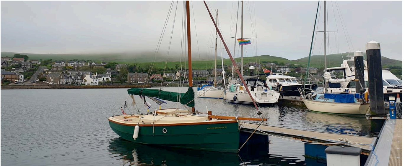
Phyllis berthed at Campbeltown on the Mull of Kintyre & Lighthouse on Lamlash near Holy Isle

The next day we made use of the gentle northerly and had a lovely run to Campbeltown, which is close to the southern tip of the Mull of Kintyre (as in the song). The marina is small but has good facilities and the chap who greets you is very helpful. The showers were good and there's a Tesco in town, which was fortunate as I'd underestimated how much wine we would drink.