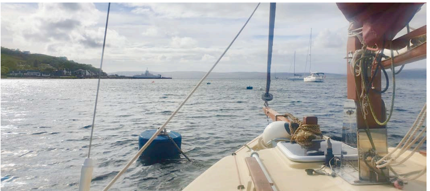
Looking north from our mooring at Lochranza on Arran