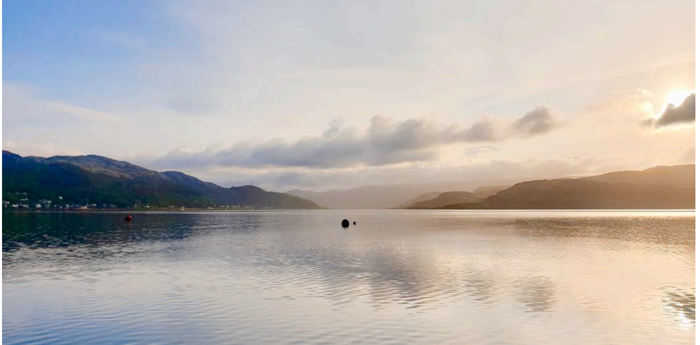
View from our mooring at Kames

After Tarbert we sailed to Kames, which is near the top of the western Kyle. You can anchor near the shore although there are a few buoys that belong to a hotel which are free for the night if you pop in for a drink. We popped in for a fantastic meal and bottle of wine so it ended up being a very expensive buoy.